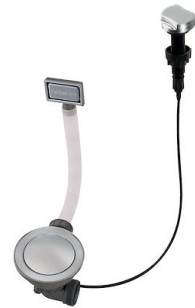
Space automatic waste fitting - PE 8407 109